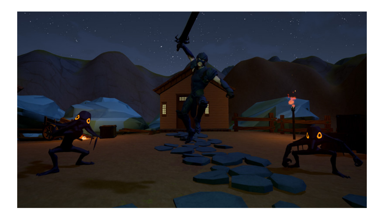
Download ->->-> <a href="http://bit.ly/2SJJ0Pm">http://bit.ly/2SJJ0Pm</a>

Rumble Fighter: Unleashed Download Thepcgames